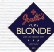
Joule's Pure Blonde

Light, refreshing & subtle, a perfectly balanced blonde ale.