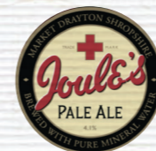
Joule's Pale Ale

We have paired some of our dishes with the Joule's Ale that best complement the flavours & below are tasting notes to help you decide for the other dishes.