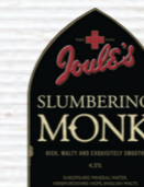
Joule's Slumbering Monk

Rich, copper ale with a real depth of flavour, created using a careful blend of English ingredients.