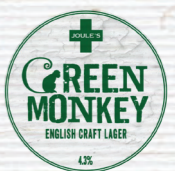
Joule's Green Monkey*

Our English craft lager Green Monkey is unpasteurised which allows the beer to keep a cracking flavour.